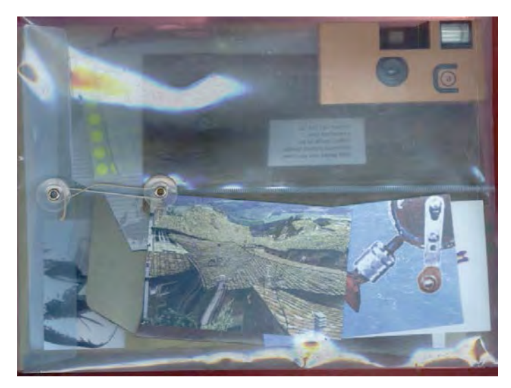
Figure.1 Cultural Probes package of Gaver et al. (1999), containing evocative tasks, a camera, postcards, etc.

The general aim of Cultural Probes is to elicit inspirational responses from people, in order to understand their culture, thoughts and values better, and thus stimulate design researchers' imaginations [5].