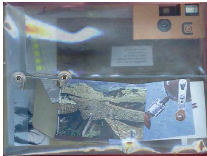
Figure.1 Cultural Probes package of Gaver et al. (1999), containing evocative tasks, a camera, postcards, etc.

The general aim of Cultural Probes is to elicit inspirational responses from people, in order to understand their culture, thoughts and values better, and thus stimulate design researchers' imaginations [5].